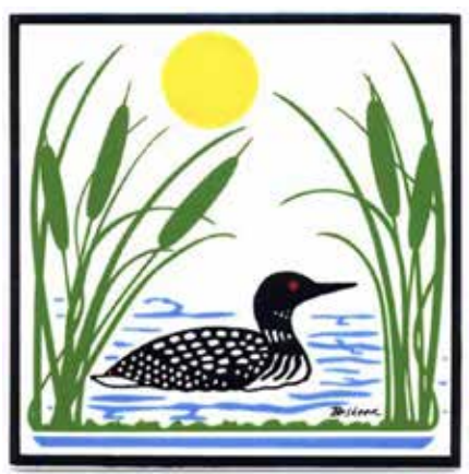
Besheer Art Tile: Loon with Cattails

Member Price: 10% discount on non-sale items The Howling Coyote Gift Shop is open daily May 1 through November 1. Members always receive a 10% discount on non-sale items.